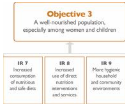
Figure 1: Objective 3 and Intermediate Results from the GFSS Results Framework

The GFSS Results Framework reflects a multi-sectoral nutrition approach to achieve Objective 3: A well-nourished population, especially among women and children. Objective 3 specifically targets women and children under five, with an emphasis on the 1,000 day window of opportunity from pregnancy to a child's second birthday, which is critical for optimum physical and cognitive development. As illustrated in Figure 1, Objective 3 is achieved through three intermediate results (IRs 7-9). Optimal nutrition outcomes are often only achieved when nutrition-specific interventions (IR8) and nutrition-sensitive interventions (IR7 and IR9) are designed in close collaboration and coordination with each other; all three intermediate results are necessary and important. Additional guidance for nutrition was developed under the MSNS and can be found in the references. 3 It should be consulted as appropriate.